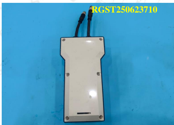
Fig 7 After the test