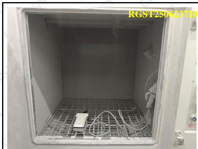
Fig 3 During the test