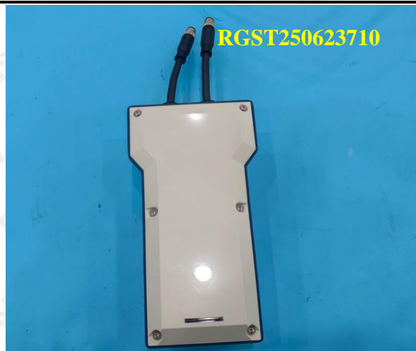
Fig 5 Before the test