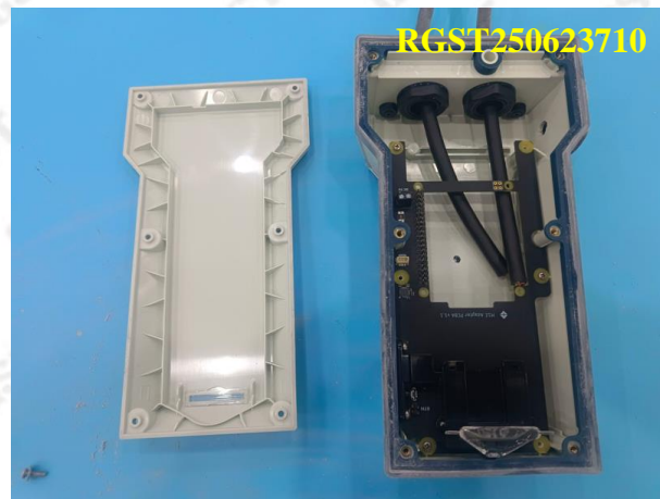
Fig 4 After the test

GST authenticate the photo on original report only