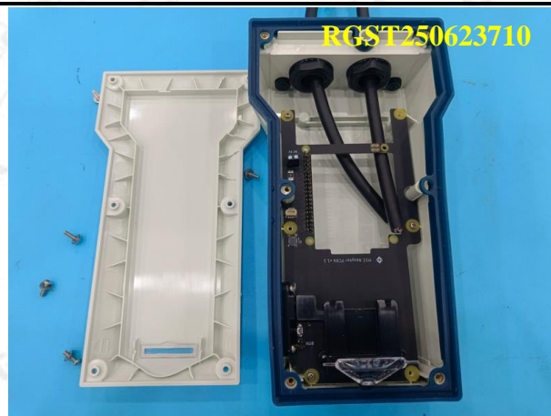
Fig 8 After the test

GST authenticate the photo on original report only