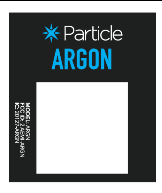
Note 1: The instruction sheet and marking should be translated to the language where the product will be sold.

Note 2: To comply with RED Directive 2014/53/EU, the manufacturer has the responsibility to put manufacturer name / trade mark and their address, batch number on the equipment. And the importer also has the responsibility to put their name / trade mark and address on the equipment before place the equipment on the market.